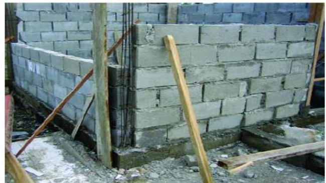
Figure 3. Confined Masonry Structure Construction in Indonesia [Meisl]

In confined brick masonry construction, the reinforcement is provided in confining elements like tie beams and tie columns while in reinforced masonry construction, the reinforcement is provided in brick masonry. For reinforced masonry construction the brick masonry used clay or concrete hollow inside for provision of the reinforcement as can see in figure 3 and figure 4. The confinement of the masonry structure is not only limited to the reinforced concrete stiffeners but also can be used steel, timber, and other similar kind of confining members, but here we are focusing on using reinforced concrete tie-beams and tie-columns as confining element of the masonry structure.